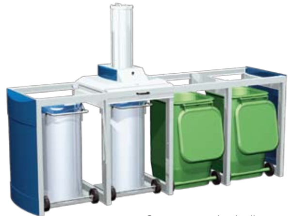
One compactor head rolls on a track above four stations.

For more info. contact us or visit our website www.orwak.us We reserve the right to make changes to specifications without prior notice. Bale/bag/bin weights are dependent upon material type.