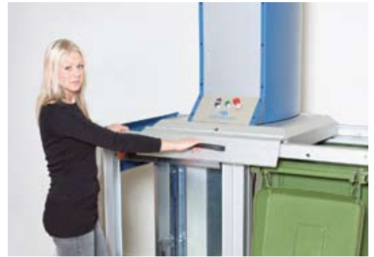
The presshead slides easily over the chambers.

You can organize a complete miniature recycling station, within a couple of square yards of floor space, where waste can be processed and conveniently sorted for immediate recycling or disposal. Flexible design allows capacity to be tailored to requirements. Little Elephant compacts into standard bins, bags and bales.