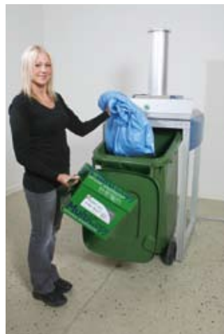
Basic single chamber unit.