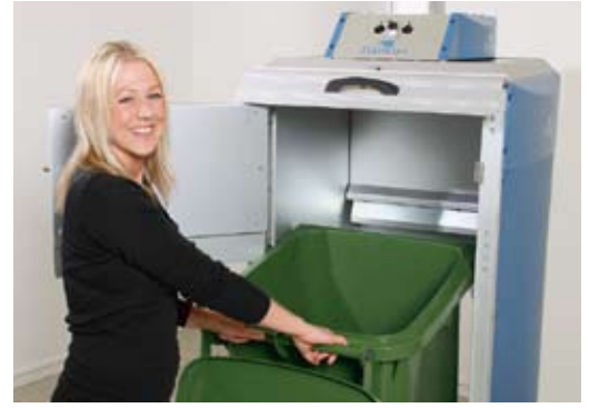
Choose FL80 for 65 gallon bins and FL100 for up to 95 gallon bins.

Based on an ingenious modular system and made from maintenance-free aluminium. Easy to feed waste material through large front loading door.