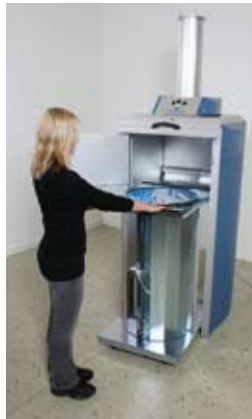
The optional BOB (Bag Or Bale) trolley for easy compacting of light waste material into bags or bales.