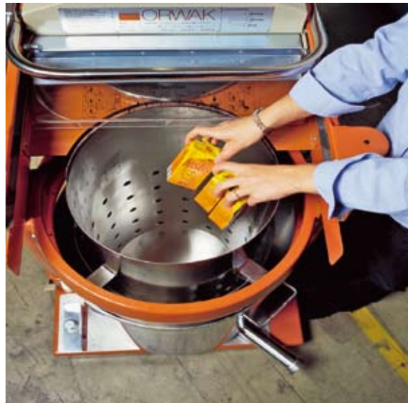
During compaction the liquid continuously drains out of the 2 inch pipe.

For more info. contact us or visit our website www.orwak.us We reserve the right to make changes to specifications without prior notice. Bale/bag/bin weights are dependent upon material type.