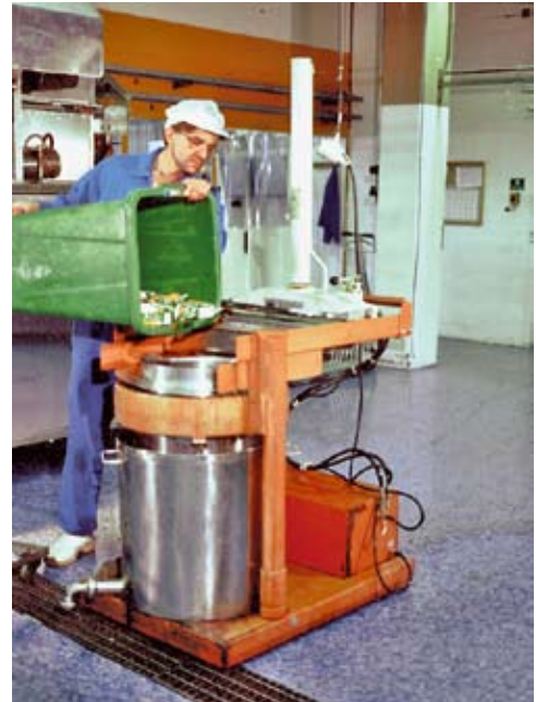
Liquid separation. Critical components made in stainless steel.

Dairies and other perishable food manufacturers sometimes have to reject batches of liquid filled packs. Orwak 5030-CE compacts the packs forcing liquid to drain off from the container.