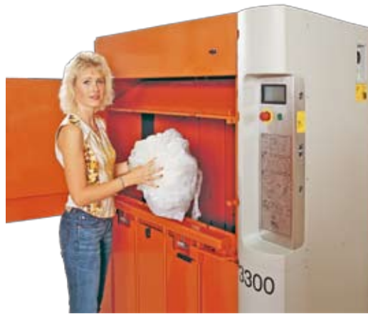
Different types of materials, such as paper or plastics, are easily loaded and compacted.

The Orwak 3300 is the result of over 30 years of experience in the market. It is safe and reliable for the operator and fast and powerful for efficient operation. Orwak 3300 is easy to handle.