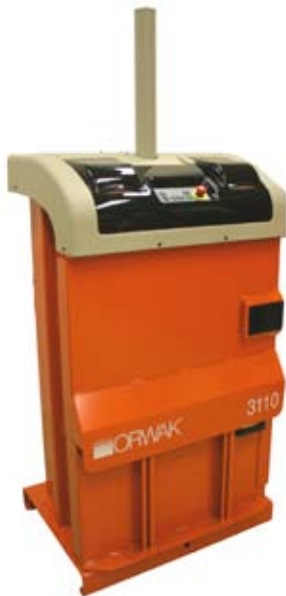
Pocket for operating manual

An autostart function allows the baler to start compacting the material as soon as you close the door.