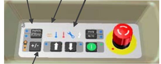
Adjustable bale size